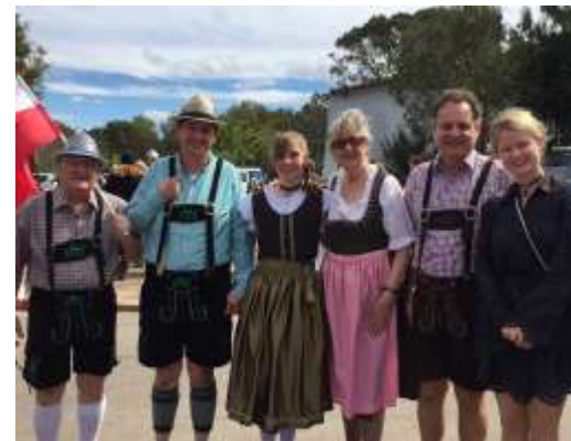
Club members at Eurofest