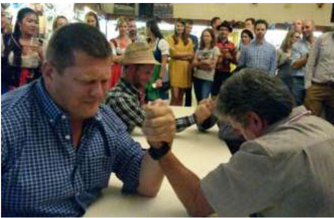
The arm-wrestling gets serious at Oktoberfest