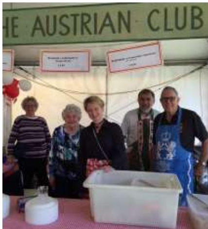
Many thanks to the volunteers at our Eurofest stall