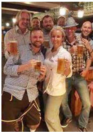
Good times at Oktoberfest dance